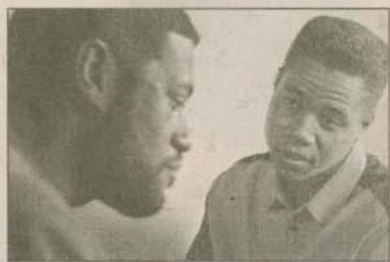
Sony Pictures Home Entertainment

After its Cannes triumph and a remarkable box-office return on the dollar, Singleton's writing/directing debut got him dual Oscar nominations at 24. Juggling half a dozen characters with ease, this cautionary tale contrasts three friends through young adulthood in South-Central Los Angeles. Fifteen years ago, the cast wasn't well known: Cuba Gooding Jr., Angela Bassett, Morris Chestnut, Nia Long and Ice Cube in his debut. More familiar was Laurence Fishburne, who is memorable as a complex authority figure.